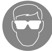
Wear safety goggles