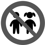
Keep away from children