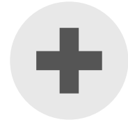
First aid / medical assistance