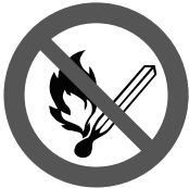
No naked flames

Store this manual in close proximity to the batteries at all times and ensure it is accessible to the relevant personnel.