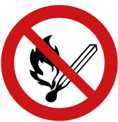
No naked flames

Store this manual in close proximity to the batteries at all times and ensure it is accessible to the relevant personnel.