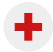
First aid / medical assistance