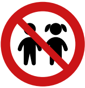
Keep away from children