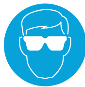
Wear safety goggles