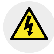
Electric shock risk